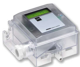
DIFFERENTIAL PRESSURE TRANSDUCER 699