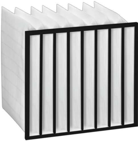
Synthetic filter (melt-blown)