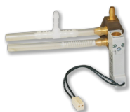
EXPANSION MODULE EM-AUTOZERO